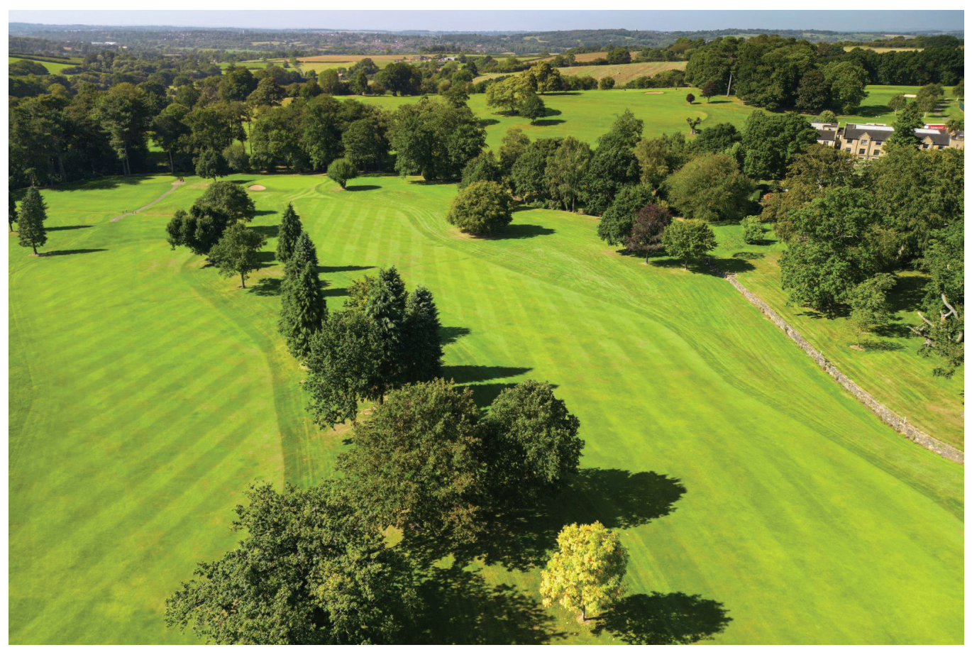
Above: Breadsall Priory Golf Club

The TTBS annual National Golf Day will be held on Thursday July 11, 2024 at Breadsall Priory Golf Club, Derby.